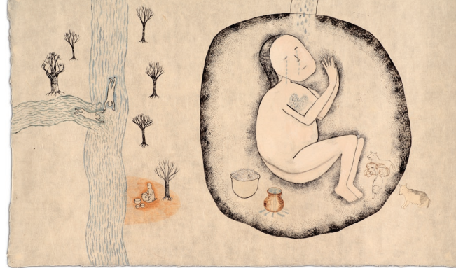
Rivers Meet , Mixed media on Japanese paper, 14.25 x 23.5", 2010

The current show in Vancouver's Art Beatus Consultancy Ltd. called On the Edge of Water features new material based on field-sketches, digital prints and photo collages created during and after a 2009/10 Canada Council Project Grant and her self-supported journeys to many parts of South Asia. During this period, she traveled by train, bus and car stopping at familiar and unfamiliar places along the way to walk, meet with people and to attend holy festivals. One significant destination was Varanasi on the Ganges River where all devoted Hindus go