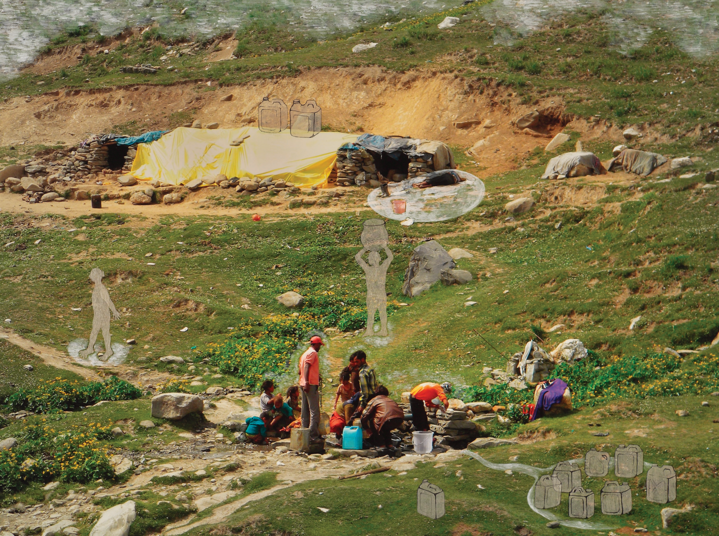
Water Gathering, Mixed media on Inkjet print 17 x 22", 2010