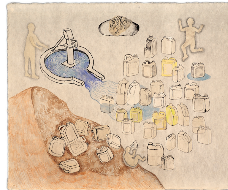
Water Tanks , Mixed media on Japanese paper, 15.75 x 19.25", 2010

There are also many emotive mixed media works in her familiar style. In Rivers Meet , an apparition of a large weeping figure seated in a fire pit dominates the composition. Its human heart is formed of tears that rained down from the clouds. Small dogs wait patiently at its feet.